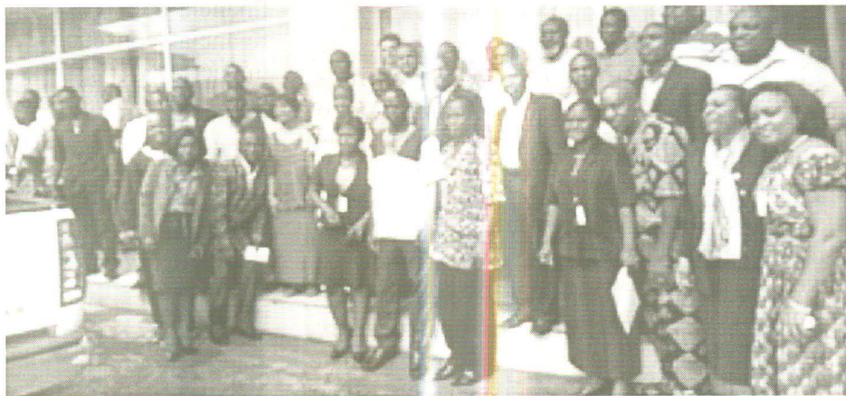
Participants posed for photograph