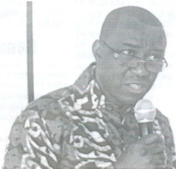
Transport Minister S. Tornorlah Varpilah