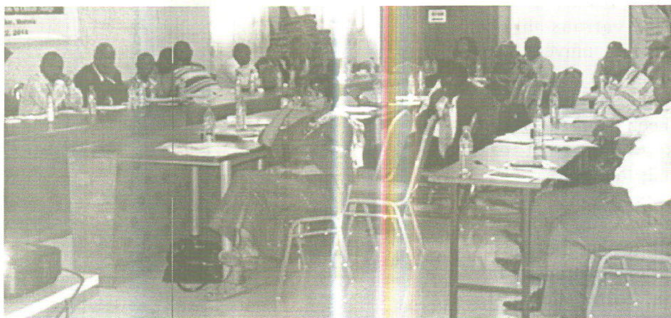
Cross-section of participants during deliberations