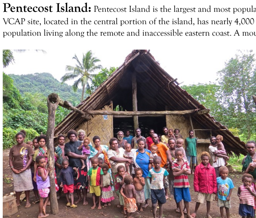
Photo above: Lalwok Village along eastern coast of Pentecost

Pentecost Island is the largest and most populated island in Penama Province. The VCAP site, located in the central portion of the island, has nearly 4,000 inhabitants with a quarter of the population living along the remote and inaccessible eastern coast. A mountain range spans the length of the island, of which the highest is Mount Vulmat (947 m) and divides the generally humid and rainy eastern coast and the more temperate western coast. The coastal plains are lined with many creeks and rivers and are generally contain very fertile soil. Access to services is extremely limited during heavy rains with a majority of footpaths becoming impassable. Erosion control and diversification of agricultural production has been indicated as needed by target communities for food security purposes.