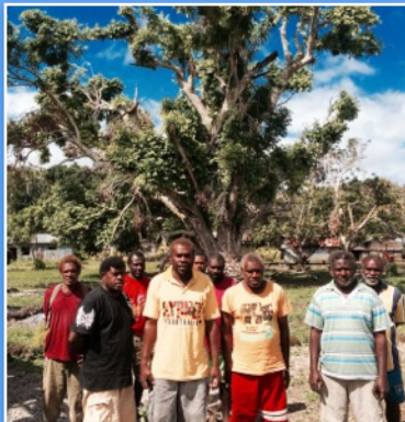
VCAP site on Epi Island

Women candidates were encouraged to apply!!!