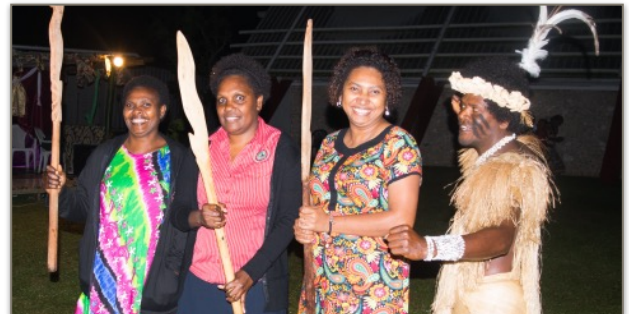
Pictured above: Left- Planning session with DLA; Right- Participants at "Social Night" Activity