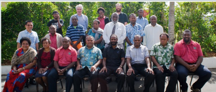
Pictured to left: participants from the Project Board Meeting for VCAP on June 18, 2015 in Port Vila

*Project Board agrees that next meeting will take place in November of 2015 in Rovo Bay, on Epi Island.