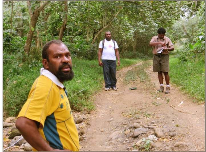
Photo above: Engineer from Public Works Department inspects road on Epi Island with VCAP design team

Epi Island: Epi Island is located in the northeast corner of Shefa Province. Villages and roads in Epi are located along the coastline, while the interior of the island is densely populated with native forest. There is limited conveyance infrastructure throughout Epi, with the longest road becoming increasingly inaccessible due to the impact of inclement weather resulting erosion of roadways, flooded creek beds and decaying infrastructure including collapsed bridges. This primary road is located through the entire VCAP site on Epi Island and improving its resilience to the increasingly frequent rains was indicated as a priority by communities during consultations. Epi’s fertile soil had led intensive agricultural development, which in turn as resulted in the substantial erosion of topsoil. This erosion has adversely affected marine-ecosystems causing harm to coral reefs and local fisheries due to sedimentation. Water security concerns are prevalent throughout the Epi site.