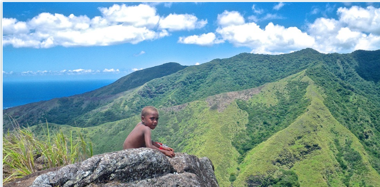
Photo above: Aneityum Island is a priority VCAP site as it is part of the Tafea Outer Islands

sparingly populated considering its size. Erromango Island is in need of support after suffering a direct hit from Severe Tropical Cyclone Pam in March of 2015 in regards to improving food & water security in communities and strengthening vital infrastructure such as footpaths and disaster shelters. Aniwa Island is the only coral atoll in Tafea Province and it has dire water security needs. Aniwa’s main sources of income generation are derived from fishing and orange production and livelihoods were severely impacted by Cyclone Pam. Aneityum and Futuna Islands are both well-known for having rich marine eco-systems and will