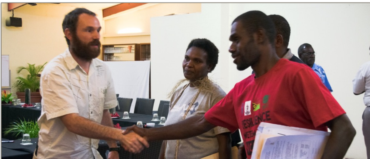
Picture above: VCAP Interim PIU staff and participants from VCAP Inception Week