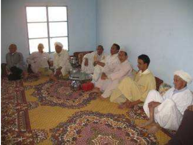
Community meeting in preparation of the project