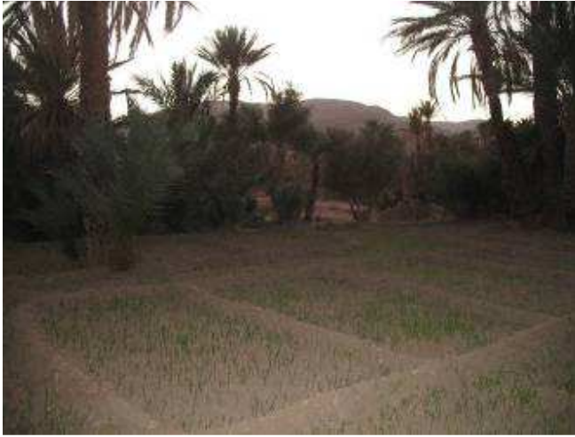
Cereal crops protected by the palm trees