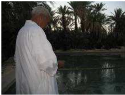
The irrigation water storage basin