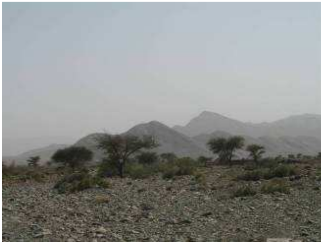
Igoul site – forestry and micro-catchment component