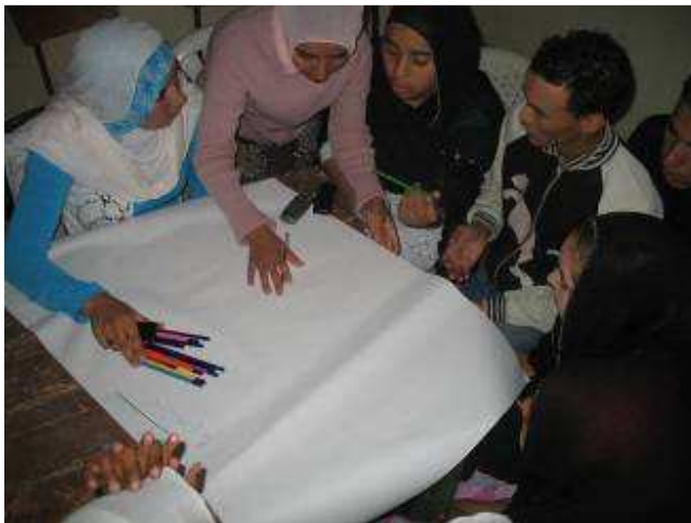
Mobilisation of young people