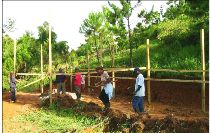
Woodford community members work together in constructing a greenhouse

The CBA project builds on JCDT's existing sustainable agriculture activities to address additional climate change pressures. The project reforests steep slopes and raises community awareness about climate-resilient practices. To increase farmers' capacity to adapt to climate change, the project promotes sustainable agricultural practices. The following activities will help the project reach its goals: