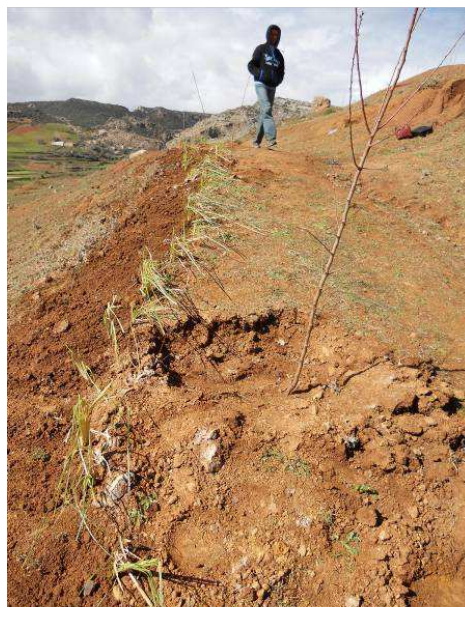
Vetiver is a natural technology used for erosion control and climate change adaptation in Sidi Majbeur.

CBA projects have contributed to protect, rehabilitate and promote 6 forest tree species (caroub tree, juniper tree, argan, acacia, green oak, ash tree), as well as 4 agrobiodiversity species (3 traditional resilient species of palmtrees, 1 rustic sheep species). Besides, CBA has supported rehabilitation of a number of traditional medicinal plants, and experimentation of 2 erosion-control forest plants (including pilot testing of Vetiver grass), and 2 resilient fodder seeds (sorgho and a specific variety of clover), tested in the Oasis context.