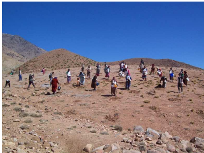
Community volunteers plant forest trees to contribute to regeneration of degraded mountain land.

Volunteerism has proved essential in project design and implementation, with individual volunteers contributing time, labor, tools, knowledge, skills, leadership.... CBA has mobilized over 1000 individual volunteers