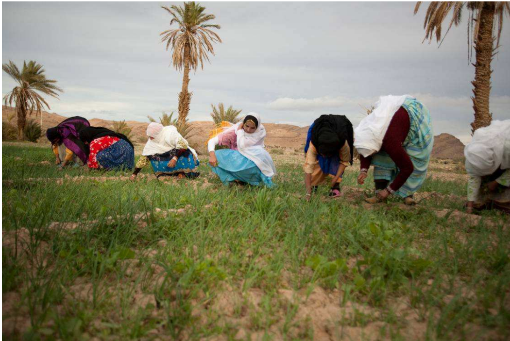
Women engage in conservation farming in Iguiwaz.

The CBA Madania project has been participating in the national Terre & Humanisme training of trainers on agro-ecology, which has given the local CBO the tools and methods to further disseminate the best practices of their project, and planting the seeds for future replication and up-scaling in the Oasis region.