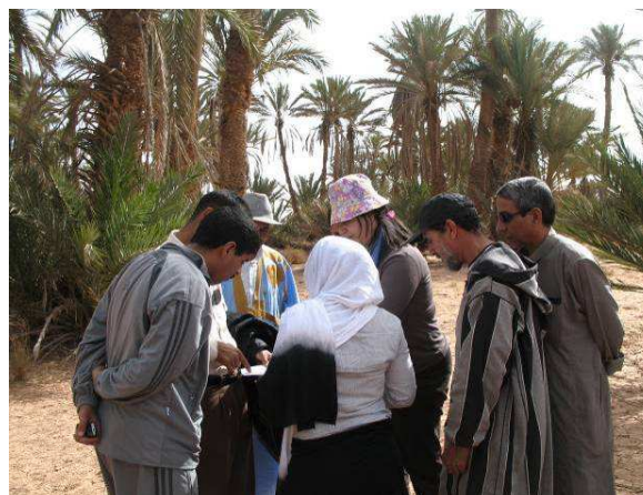
Community volunteers and project team measuring plantation site

Project writing should in the future be facilitated. Indeed, the project proposal template has proven challenging for partners to work on. Beyond a pilot, and in order to ensure access to CBA funding to grassroots organization, it is recommended to simplify it, and to translate it into local languages.