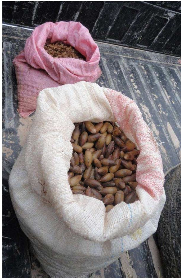
Resilient forest seeds are germinated in a nursery, before in-situ plantation, in Swit and Sremt.

Through intense capacity-building and concrete piloting of simple cost-efficient techniques, CBA projects have increased the resilience of local farming and strengthened local food security. Conservation