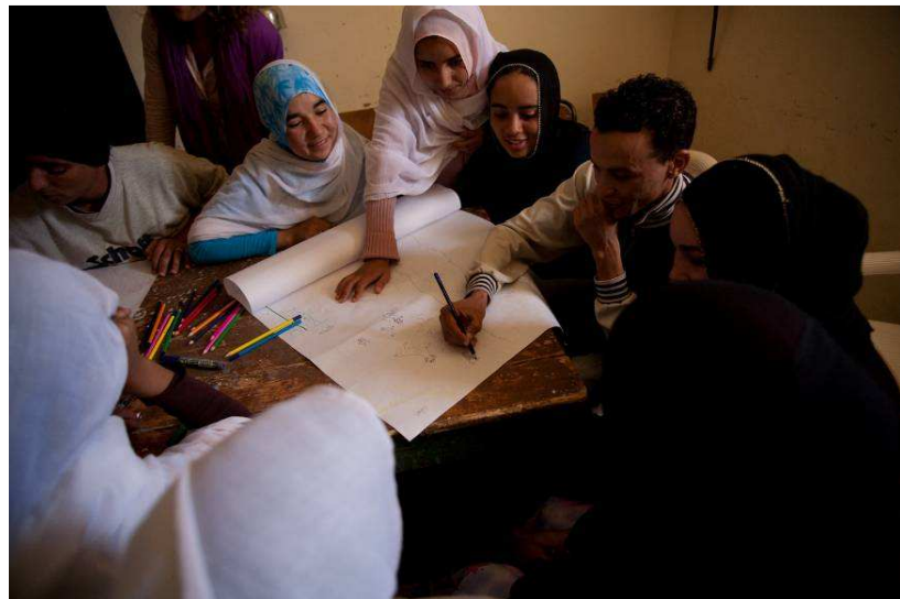
Youth participate in climate change awareness-raising, in Iguiwaz.

Indeed, with limited resources, CBA Morocco had to privilege multipurpose activities (capacity building incorporated in all