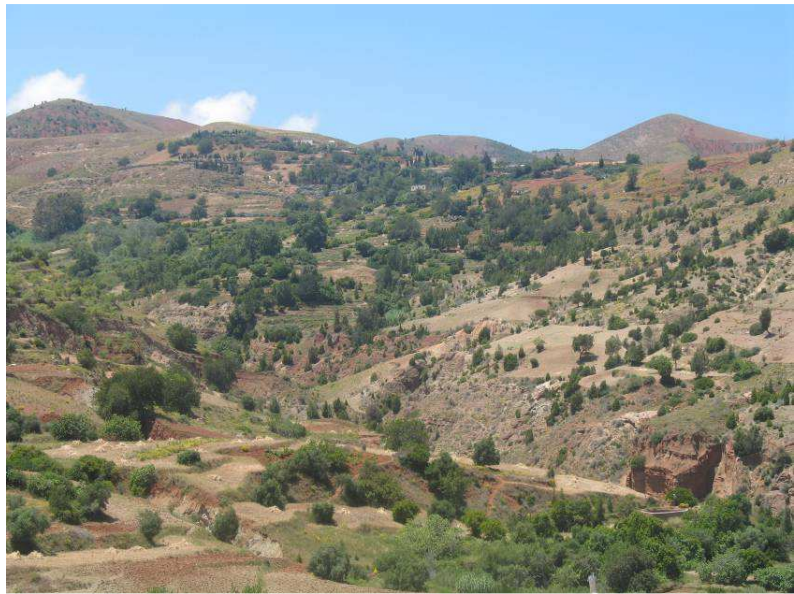
Alternance of Droughts and intense rainfalls have accelerated erosion in Coastal mountains (Boumaad).

The lower coastal areas have been increasingly impacted by sea rising-related risks (storms, water salination). Higher altitude mountain coastal areas are characterized by fertile clay soil, degraded by erosion and salination. Ecosystem consists mainly in degraded forests and low formations.