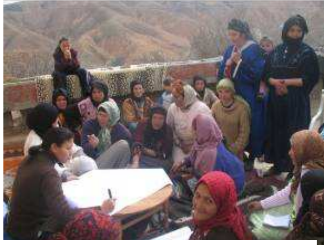
Women participating in VRA workshop in El Mouddaa

Building on SGP experience, CBA has advocated for participatory project governance, through the constitution of local project committees. Grantees have been supported and trained to establish inclusive M&E structures, mobilizing all community groups. Some successes can be highlighted, including the AMSING project, where women and men, youth and elders are involved in project implementation and governance. However, local project committees have generally not been very efficient in project M&E and governance, due to limited capacities of the grantees to facilitate local consultation. It will be essential for future project sustainability to design concrete modalities that allow meaningful and equitable local participation not only in project design and implementation, but also in M&E and governance.