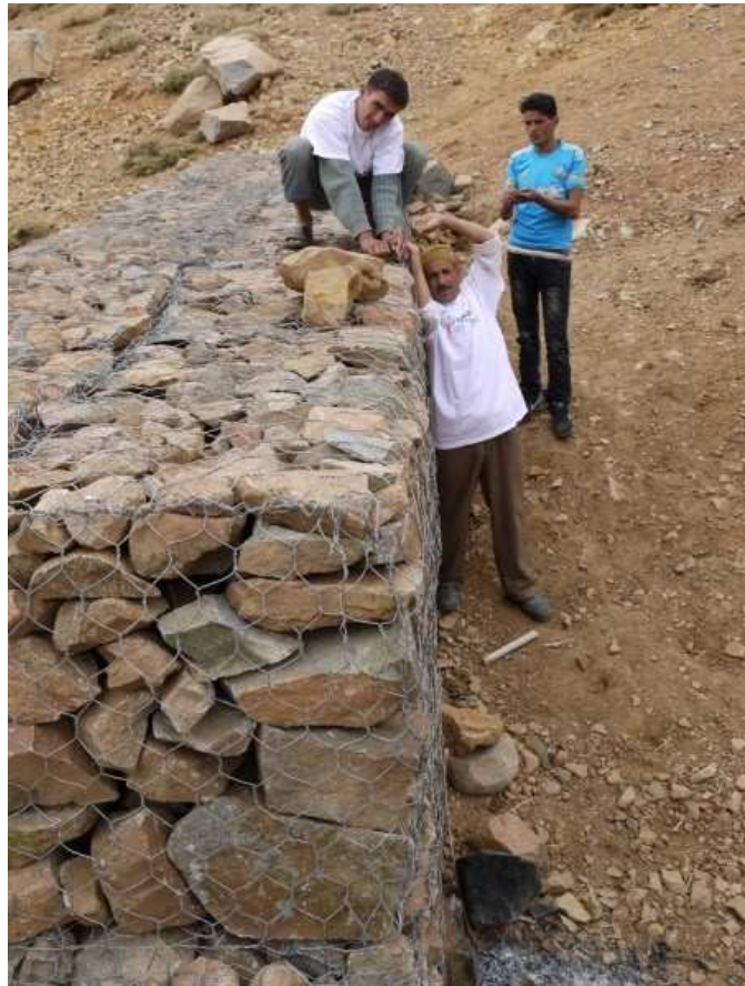
Community volunteers build ravine management infrastructures to reduce impacts from flash floods in El Mouddaa.

Besides, the project has promoted 5 biological and mechanical innovations aiming at combating erosion and restoring forest ecosystems, including pilot testing of vetiver grass and rehabilitation of traditional medicinal plants for land regeneration, testing of nursery-germination of forest trees, restoration and improvement of traditional water catchments and mechanical ravine management to reduce the impact of floods and combat erosion. Additionally, the El Mouddaa project has tested an experimental flood-detection system, aiming at supporting community preparedness and improve disaster risk management in high altitude mountains.