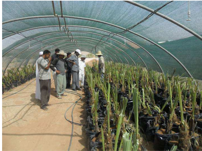
Resilient palmtree shoots are conserved in nursery, before replantation in the oasis (Laachoria)