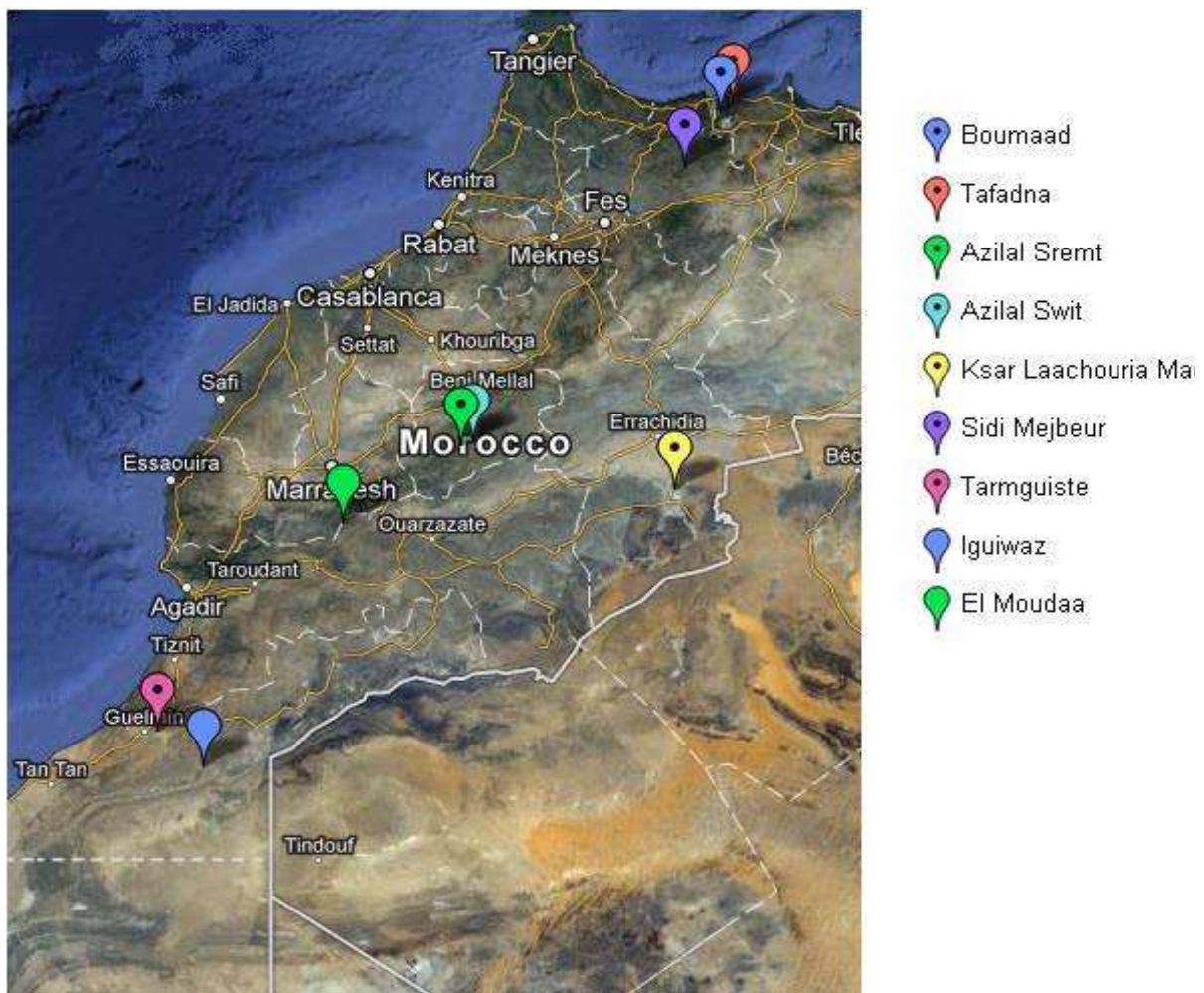
Figure 3 – CBA Project location map

Over 1,000 community volunteers (including over 200 women and over 200 youth) have contributed to CBA Morocco project activities, providing time, labor, knowledge, leadership. Promotion of volunteerism throughout project design, implementation and monitoring has been a key element to ensure and sustain meaningful participation, and has powerfully contributed to social inclusion, by valuing each individual's contribution.