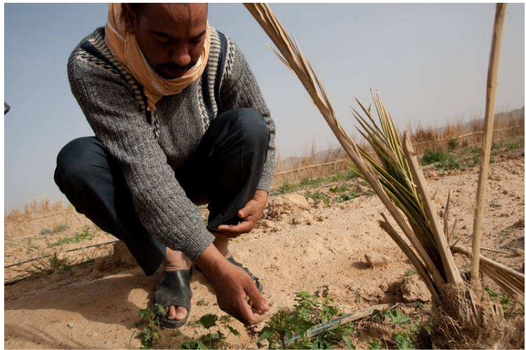
Drip irrigation technology tested in the Iguiwaz Oasis, to improve water management in a context of increasing water scarcity.

During project design and proposal writing, CBA Morocco has put much effort in trying to integrate the various sets of indicators within a log-frame analysis approach, connecting indicators with concrete project outputs, so that they can easily be measured at activity or output levels. During implementation, we have focused on capacity-building, to support partners in monitoring the indicators.