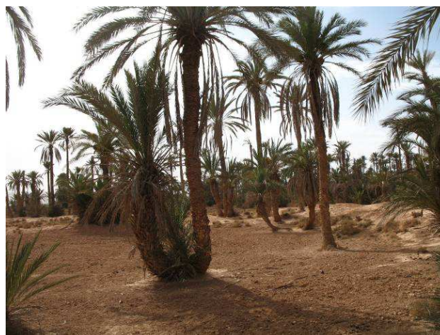
The Tarmguiste palmeraie, severely impacted by increasing temperatures, diminishing overall rainfalls, and more and more intense extreme episodes (droughts, destructive rainfalls).

South of the Anti Atlas & High Atlas mountains, 44 000 ha of Oasis extend in the Provinces of Errachidia, Ouarzazate, Tata and Guelmim, and further east, in the province of Figuig. 7% of Morocco's rural population (1 million people) live in Oasian context. Bordering the Sahara, Oasis have a critical ecological role, and are exposed to major risks including climate change. The local climate is Saharan, characterized by frequent sandstorms and strong winds, high temperatures in the summer (over 40°C in July-August). Rain is irregular and rare, with 90% of annual rainfall registered between October and March, typically in the form of increasingly violent rainstorms. Climatic observations over the last three decades (1976-2006) show intensified and increasing frequency of droughts and floods, due to climate change. These trends are expected to intensify in the future.