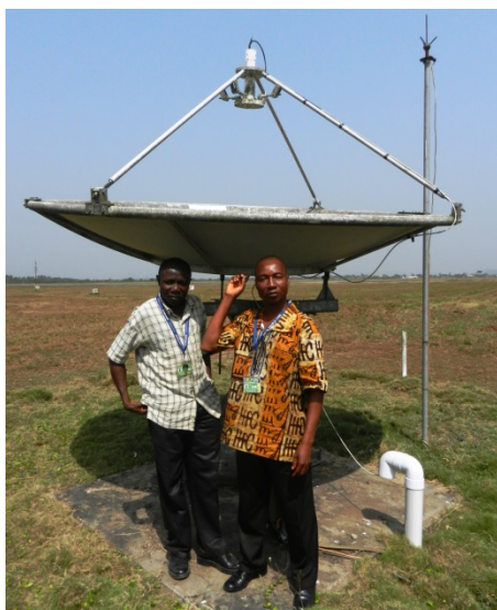
Figure 1: Forecasters at Roberts International Airport with the AMESD satellite receiver.

The main economic sectors of Liberia, including agriculture, fisheries, forestry, are highly vulnerable to climate variability and change. The agricultural sector contributes over 66% to Liberia's Gross Domestic Product (GDP) and over 90% of subsistence farmers are dependent on rain. Recent changes in rainfall patterns have made it increasingly difficult to identify the optimal time to plant crops. The onset and duration of seasonal rainfall is becoming unpredictable, aggravating pest and disease problems. Any climate change impact on fisheries will affect food security, because fisheries provide the main source of animal protein in the typical Liberian diet. Climate change will impact forestry by affecting tree growth, as well as tree survival and timber quality, which will also be negatively impacted by pests and diseases. In addition, changes in rainfall and temperature patterns are expected to result in an increased incidence of water-borne diseases, such as malaria, cholera and dysentery. The Liberian hydro-meteorological services have a limited capacity to monitor, forecast, archive, analyse and communicate information on water resources and climate.