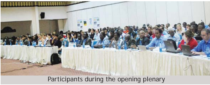
Participants during the opening plenary