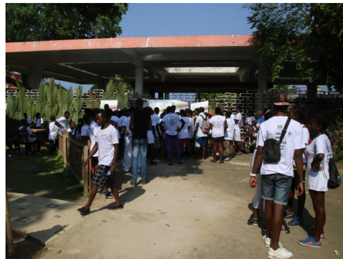
PHOTOS OF THE FAIR

Nota: a previsão será atualizada caso houver mudanças significativa do tempo