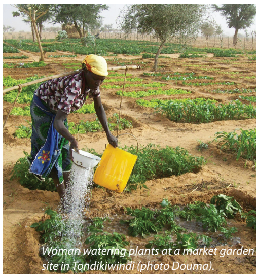
Woman watering plants at a market garden site in Tondikiwindi.

85% of the population of Niger depend on agriculture for their means of subsistence. Agriculture is basically rainfed, and therefore vulnerable to climate change.