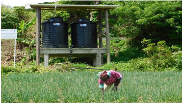
SV3-IICA – Farmer (Audrey Butler) using sustainable agriculture practices learnt through training provided and tanks from irrigation in background.