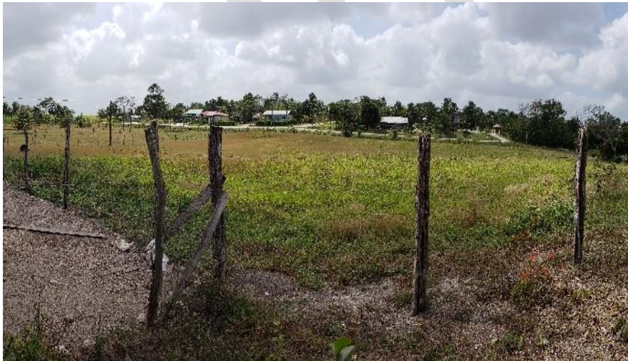
B1-Climate Smart Aviculture - 4 acres of pasture grass established at Manuel Blanco's farm (Output 2.4)