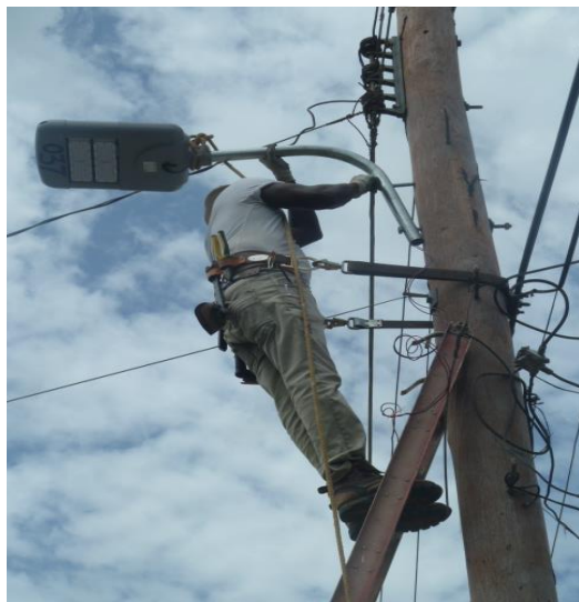
GY2-Bartica - Installation of energy efficient lights in Bartica, Guyana