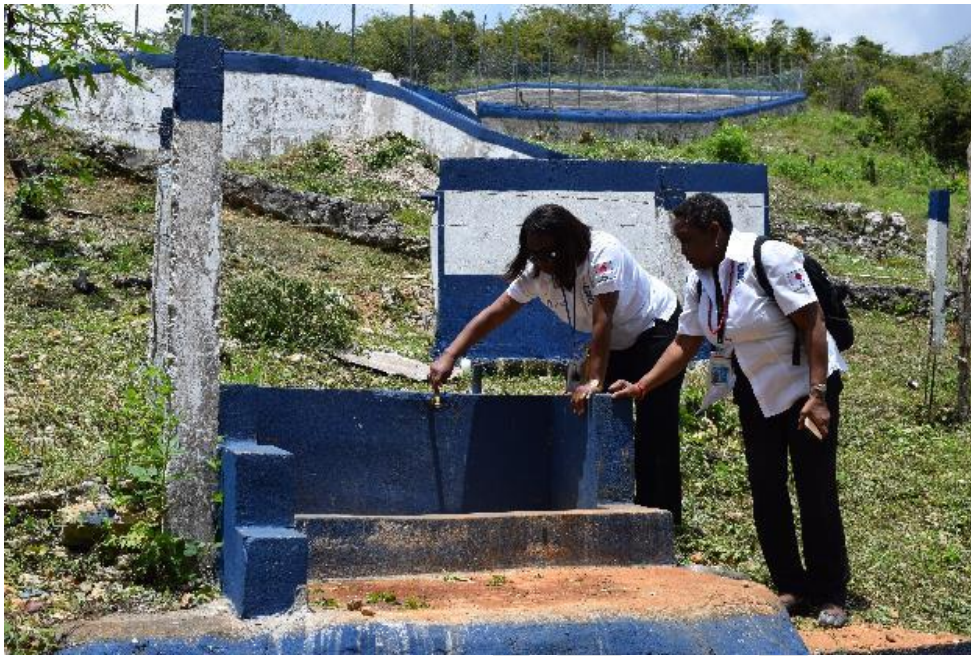
JM1-Clarendon – Rehabilitation of cistern at Richmond Park