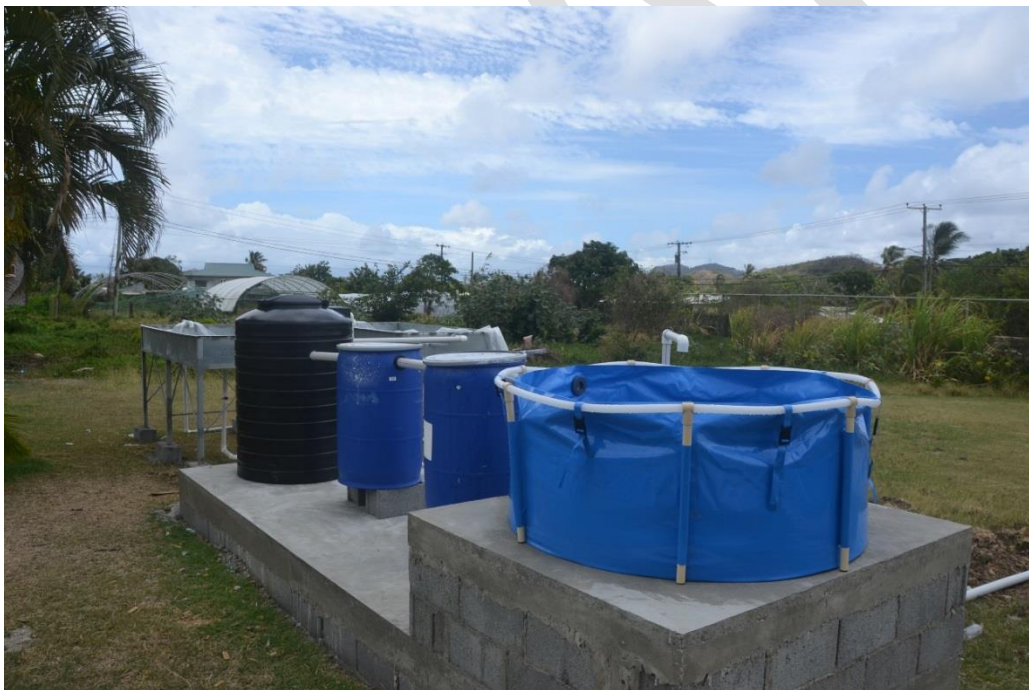
SL2 – Aquaponics system installed at Vieux Fort Campus B School