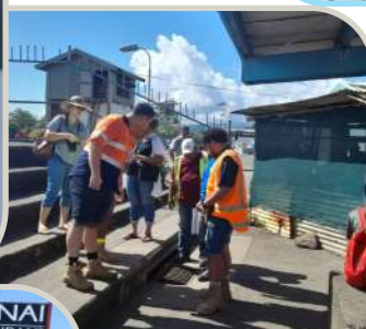
Joint Site Visit on 23 rd August 2022