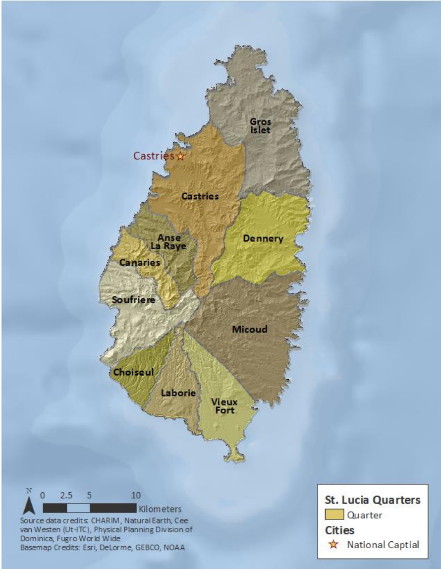
Figure 1. General overview map of Saint Lucia.

homes, and loss of livelihoods. From 1990-2014, cyclones and storms were responsible for 74.4% of combined economic losses to Saint Lucia ( http://charim.net/stlucia/information , 2014). Figure 1 presents a basic overview of administrative information for Saint Lucia.