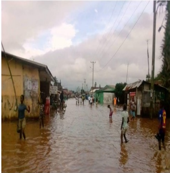
Figure 2: Flooding in New Kru Town, Monrovia