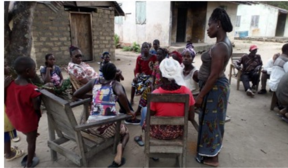
Focus group discussion in Gbeydin Town, Nimba