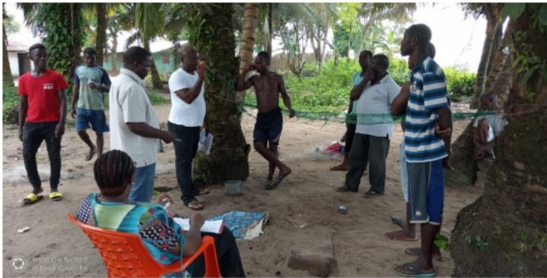
Discussing with Kru fishermen in Greenville