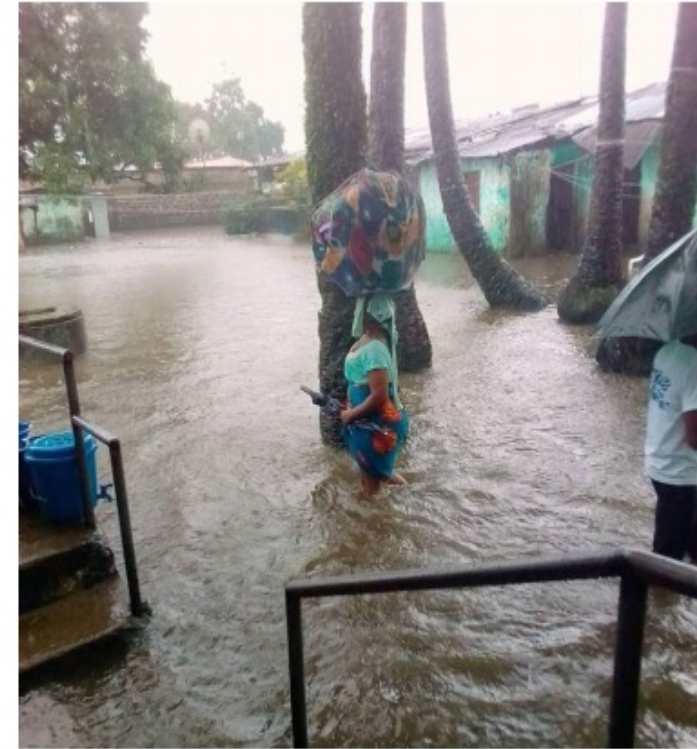
Figure 4: Impact of flooding in New Kru Town : resettlement