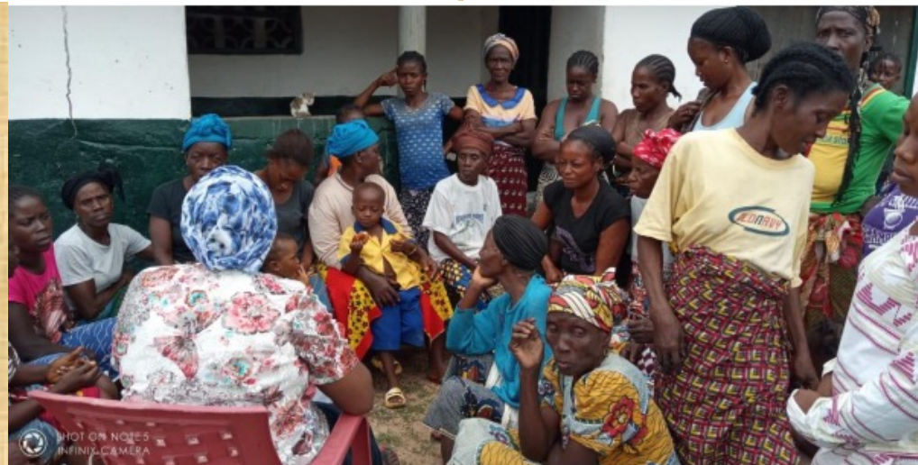
Figure 10: Meeting with women in Grand Gedeh