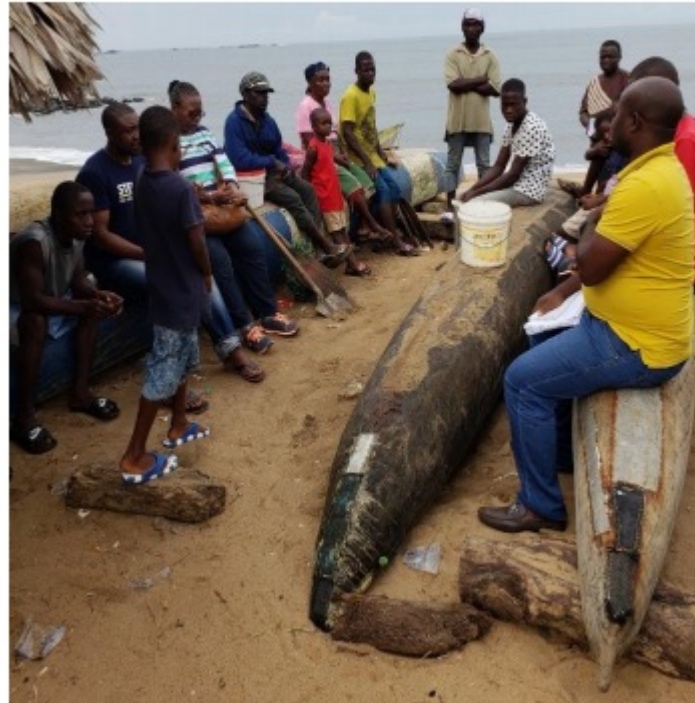
Figure 3: Meeting men and women in the fishery sector in Buchanan, Grand Bassa